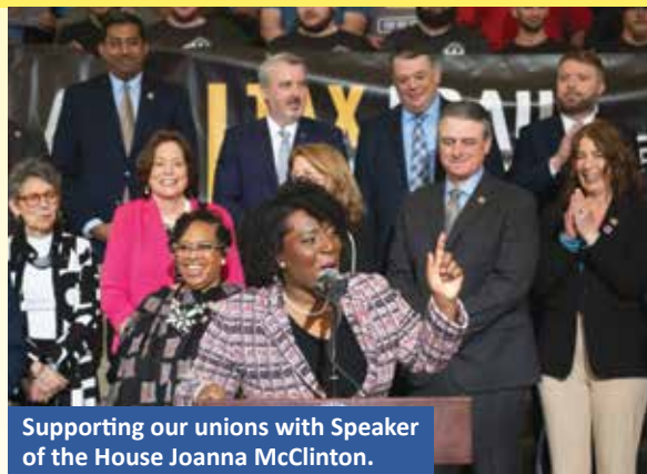
Supporting our unions with Speaker of the House Joanna McClinton.